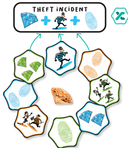
e.g. 1 thief + 2 fingerprints + 3 diamonds

All players then check & confirm if the theft incident is correct. If the player was right, they collect the 3 cards that create the theft incident and place them in a winning pile, face up, in front of them.